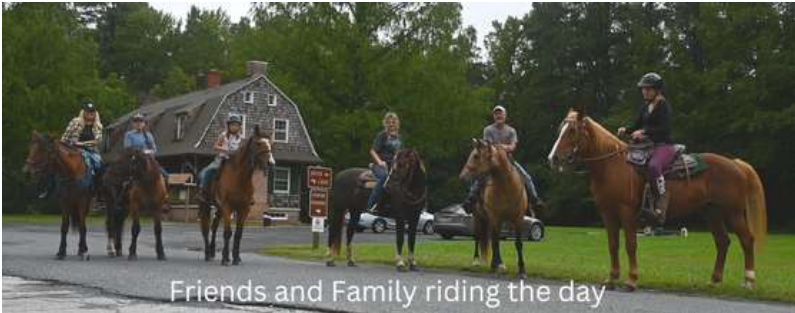
Friends and Family riding the day

Not even a tropical storm could dampen the spirits at the 2023 Member Appreciation Day was held at Redden State Park Headquarters on Sunday, September 24th.